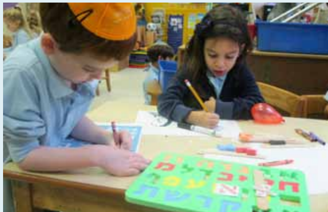
Kindergarten children in the Ivrit immersion program practicing Hebrew letter writing. Ramaz School, New York.

more likely incorporated the beliefs and actions of the woman who raised him, through her own example, to be concerned and empathize with the plight of others. Perhaps Moshe intended to emulate Abraham—but he would have done so knowing that Bat Par'oh would be proud of his actions.