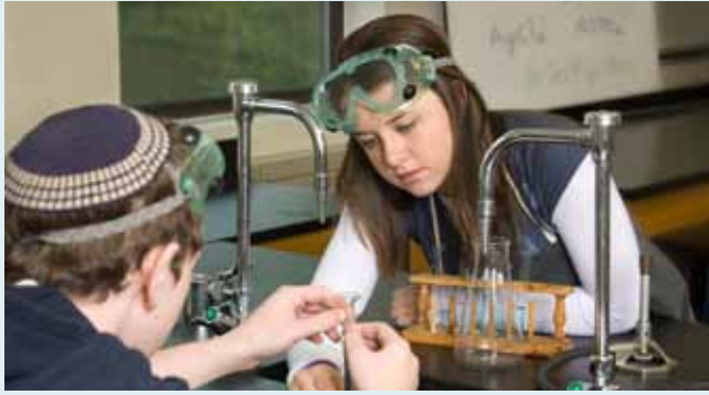
10th grade students in chemistry lab. Melvin J. Berman Hebrew Academy, Rockville, MD