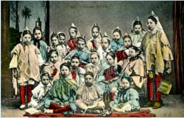
Class of girls from the Ecole Juive, Tunis Early 20th century postcard

and he struggles with whether to join with the other students who abridge the tefillah or say a full tefillah and risk appearing arrogant.