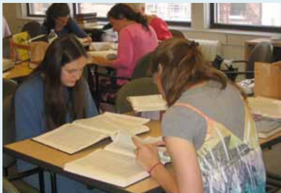
Participants in Drisha High School Program