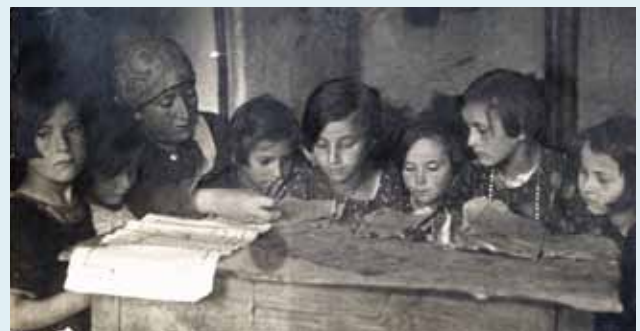
Teacher and students at a girls’ kheyder, Lazkarzev, Poland