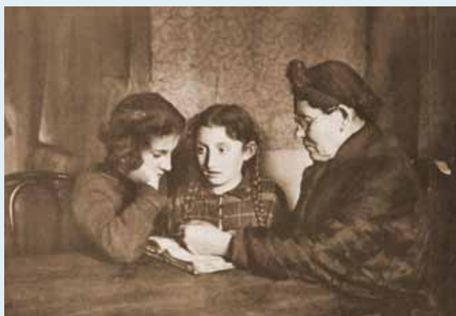
published May 9, 1926 in the Jewish Daily Forward.

Throughout my career, I have drawn on Swiss psychologist Jean Piaget's theory of learning and cognitive development, as it so aptly addresses active learning and concept building. According to Piaget, the more children relate to, define, and predict the world around them, the more they will learn. When learning, we assimilate (or incorporate) new information or text into our existing schema (rules of understanding). If, however, we are exposed to something we cannot define, predict, or understand, or when faced with inconsistencies, we enter an (uncomfortable) state of disequilibrium, in which we try to “tweak” and work out the inconsistencies until they make sense. We will either ignore what we cannot understand, or construct newer levels of understanding that accommodate the conflicting information. Sometimes this new understanding will hold over time; sometimes it won't. These states of disequilibrium provide effective learning opportunities because the learner actively wrestles with material to relieve the dissonance, bringing in additional sources, details, or observations to help reach a more encompassing level of understanding. In