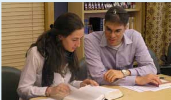
Students in June Collegiate Program at Drisha

F ounded in 1979, Drisha Institute has been a pioneer in advancing rigorous, high-level textual scholarship for Jewish women. In recent years, as Drisha has evolved into an active and vibrant learning community with a wide range of programs, it has begun to incorporate and expand its coed classes and programs. These include a Collegiate June program, a Collegiate Winter Week of Learning, an Adult Education Winter Week of Learning; a Sunday Night Open Beit Midrash, and an Engaged Couples Class. Also coed are many continuing education classes and special programs throughout the year including evening classes, Lunch and Learn sessions, and public lectures. The core text classes remain “women only,” as are the bulk of the classes offered.